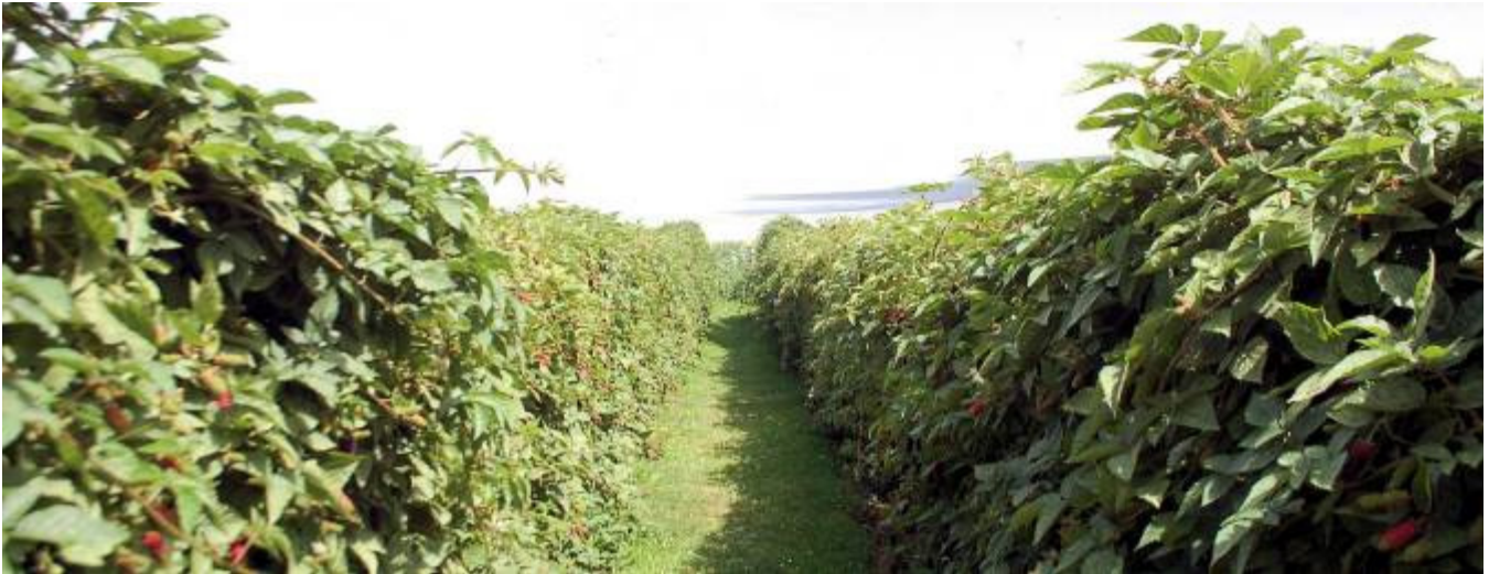
Rows of raspberries under the netting

All of Graham's berries are grown under netting which not only keeps the birds out, but also the hail. It is also designed to withstand a heavy snow storm as the net will merely stretch and then rise once the snow has melted away.